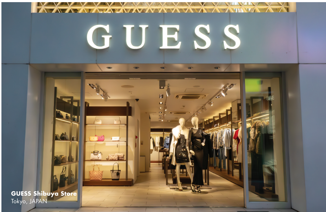
GUESS Shibuya Store Tokyo, JAPAN