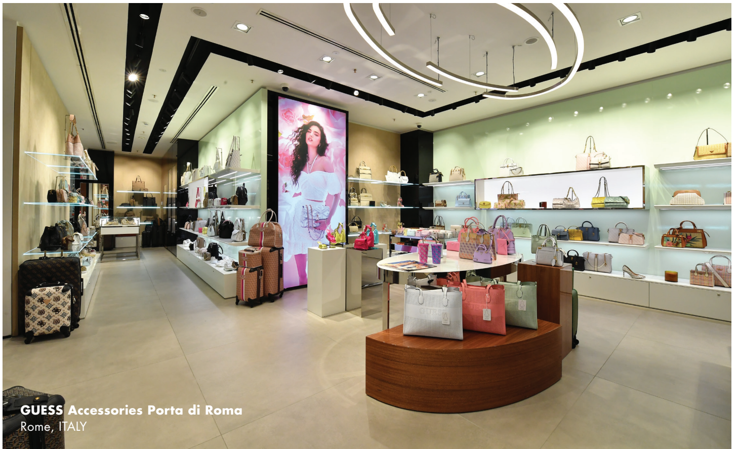
GUESS Accessories Porta di Roma Rome, ITALY