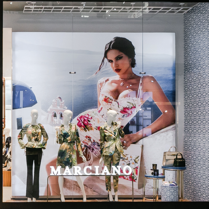
MARCIANO Metropolis Mall Moscow, RUSSIA