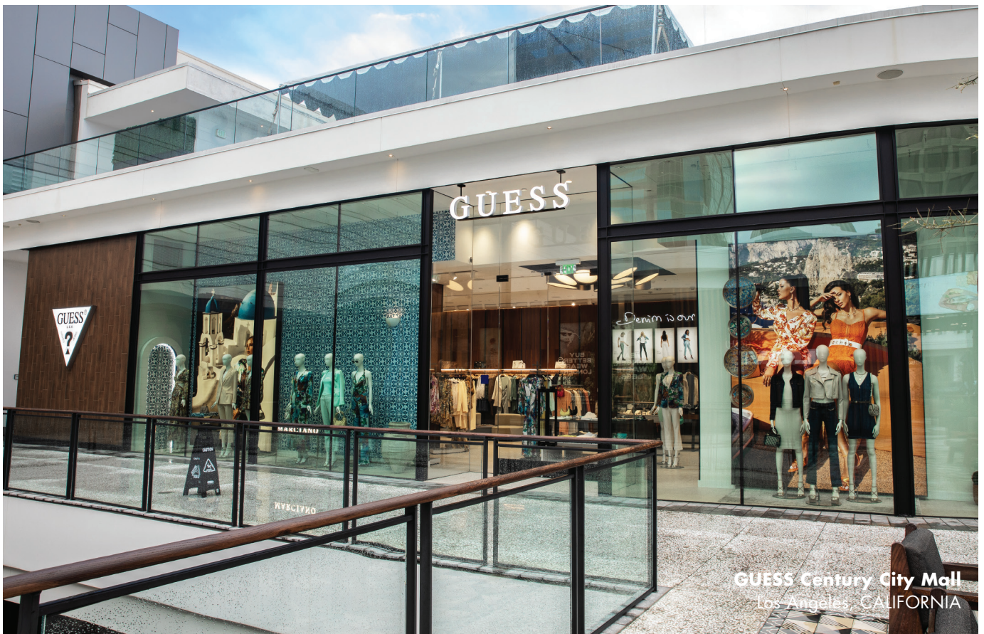
GUESS Century City Mall Los Angeles, CALIFORNIA